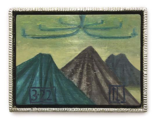
Celestial 2022 oil paint on gesso ground 310 x 405mm