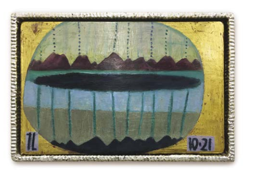
Rain 2021/2022 oil paint and gold leaf on gesso ground 305 x 445mm