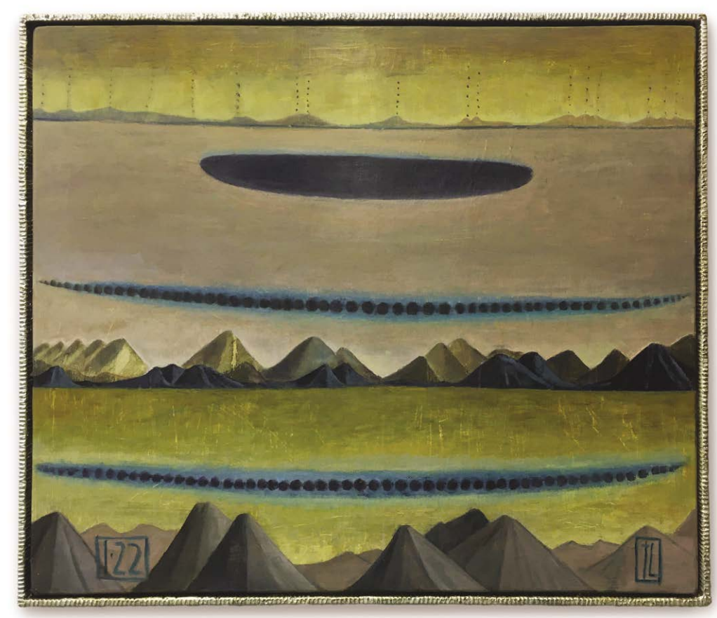
DNA 2021 oil paint and gold leaf on gesso ground 953 x 1105mm