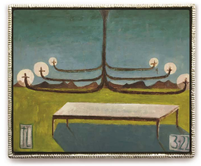
Altar 2022 oil paint on gesso ground 610 x 740mm