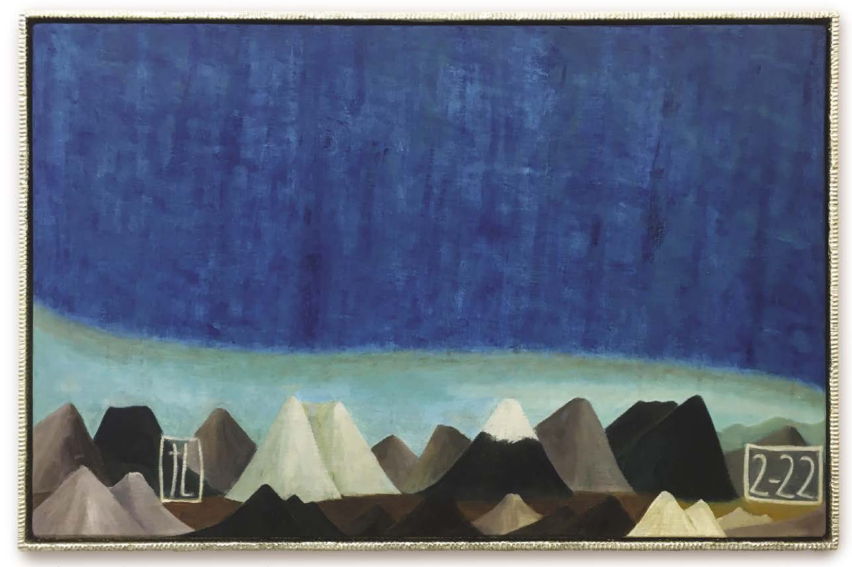
Aureole 2022 oil paint on gesso ground 835 x 1250mm