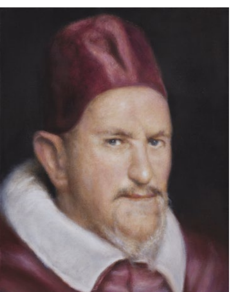
Pope Innocent x: After Velazquez 2022 oil on linen 910 x 660mm Pope ii 2022 oil on linen 750 x 380mm