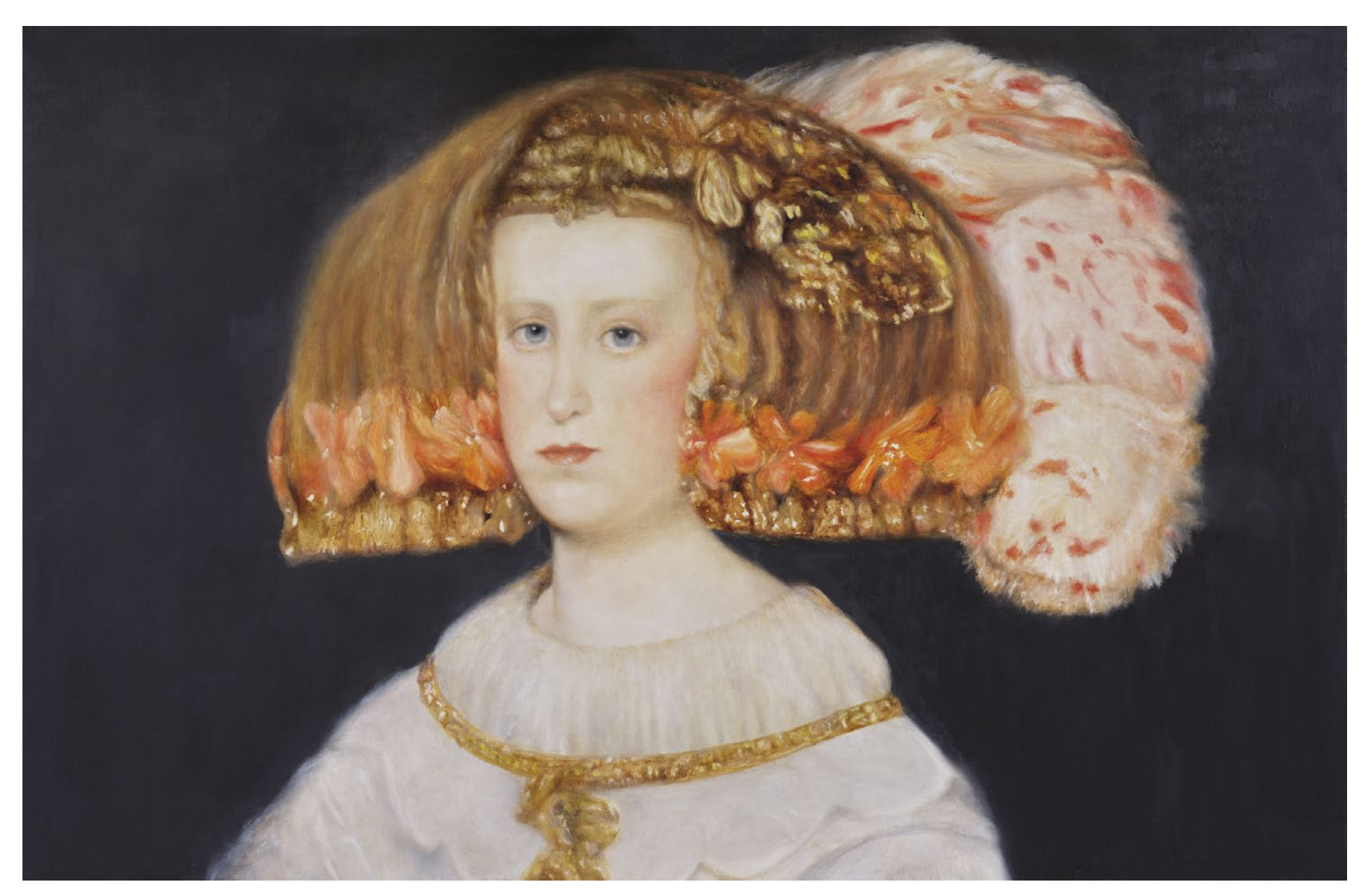
Queen Mariana 2022 acrylic on canvas 960 x 1490mm