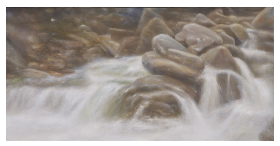
Otira Waterfall 2020 oil on linen 380 x 760mm