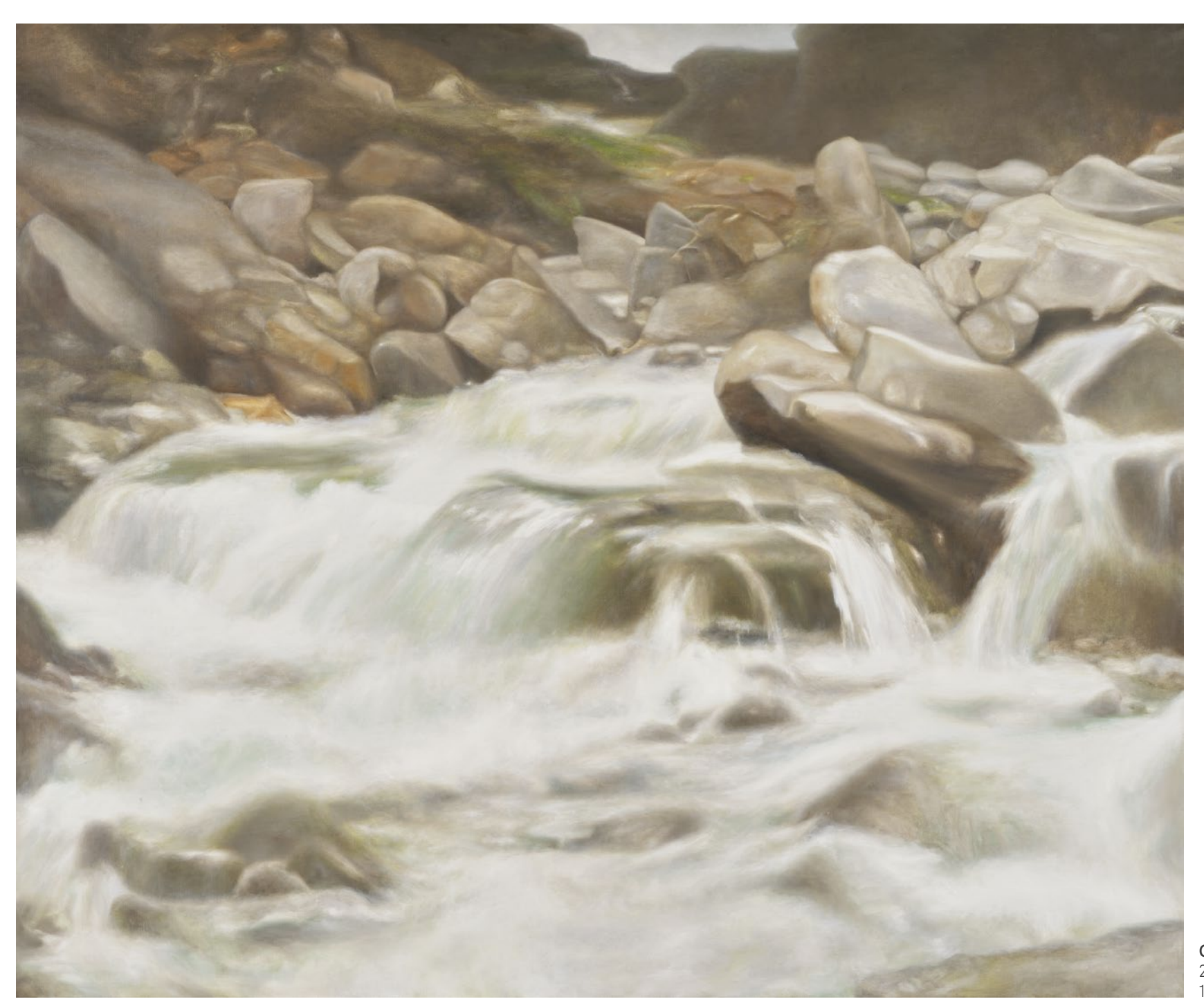
Otira: After Van der Velden 2020–22 oil on linen 1500 x 1800mm