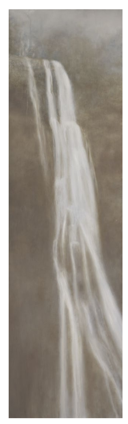
Evening Falls: Karekare 2022 oil on linen 1600 x 750mm Waitakere Falls: After Valentine 2021 oil on linen 1820 x 520mm