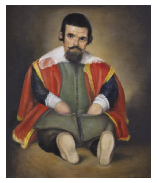
Sebastian de Morra: After Velazquez 2022 oil on linen 600 x 500mm