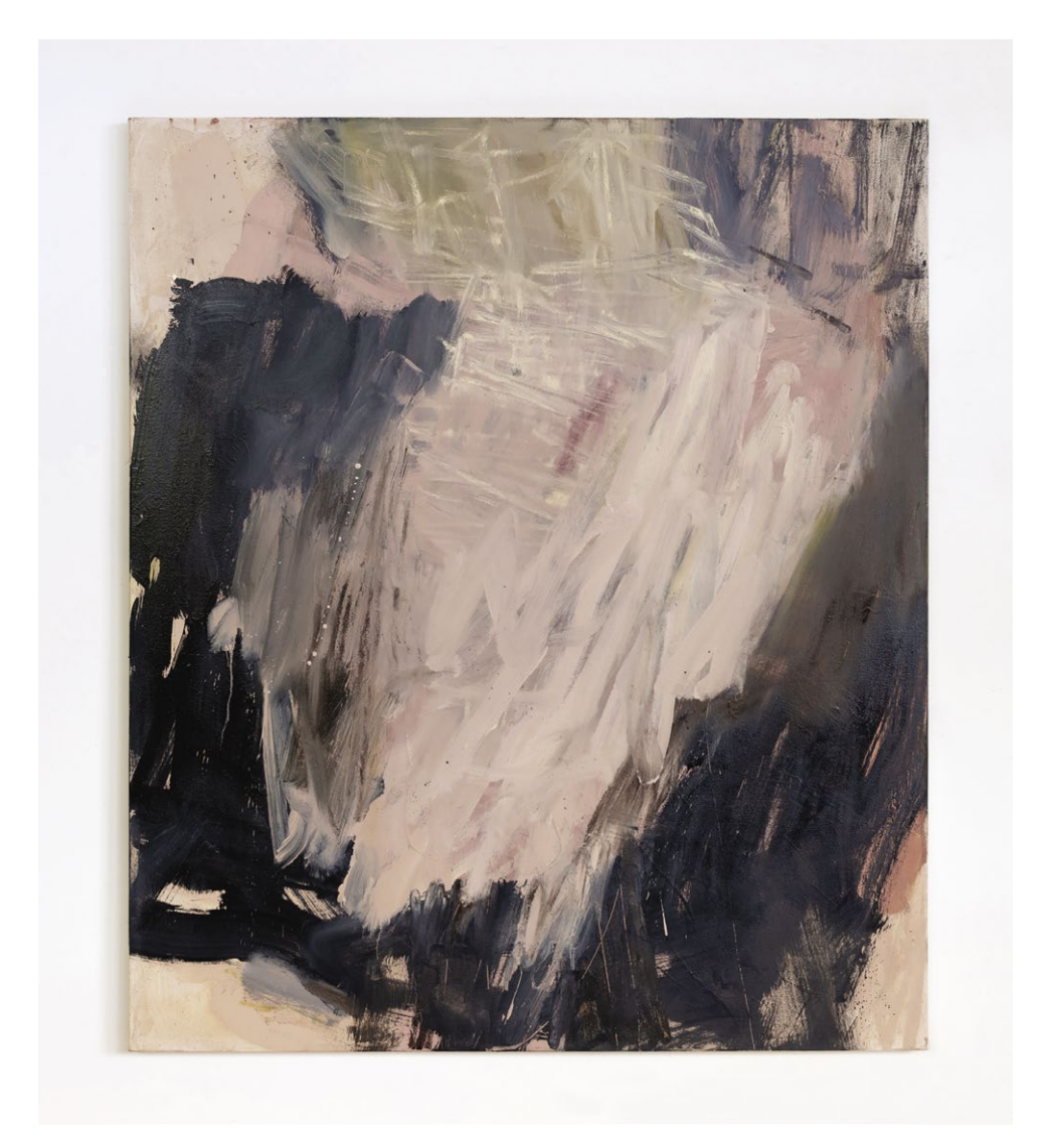
Sleep Walking 2023 oil on canvas 1200 × 1400mm