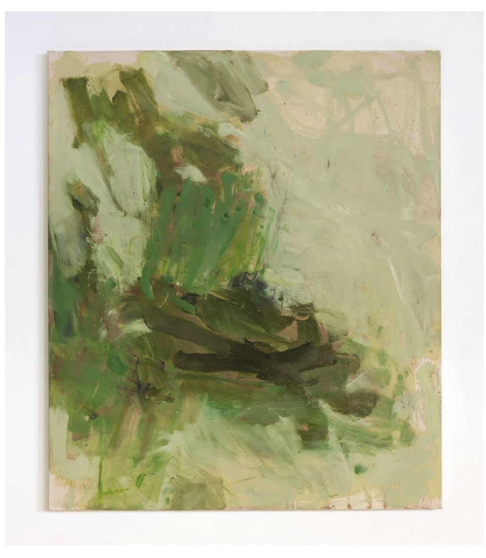
Sedimentary 2023 oil on canvas 1200 × 1400mm