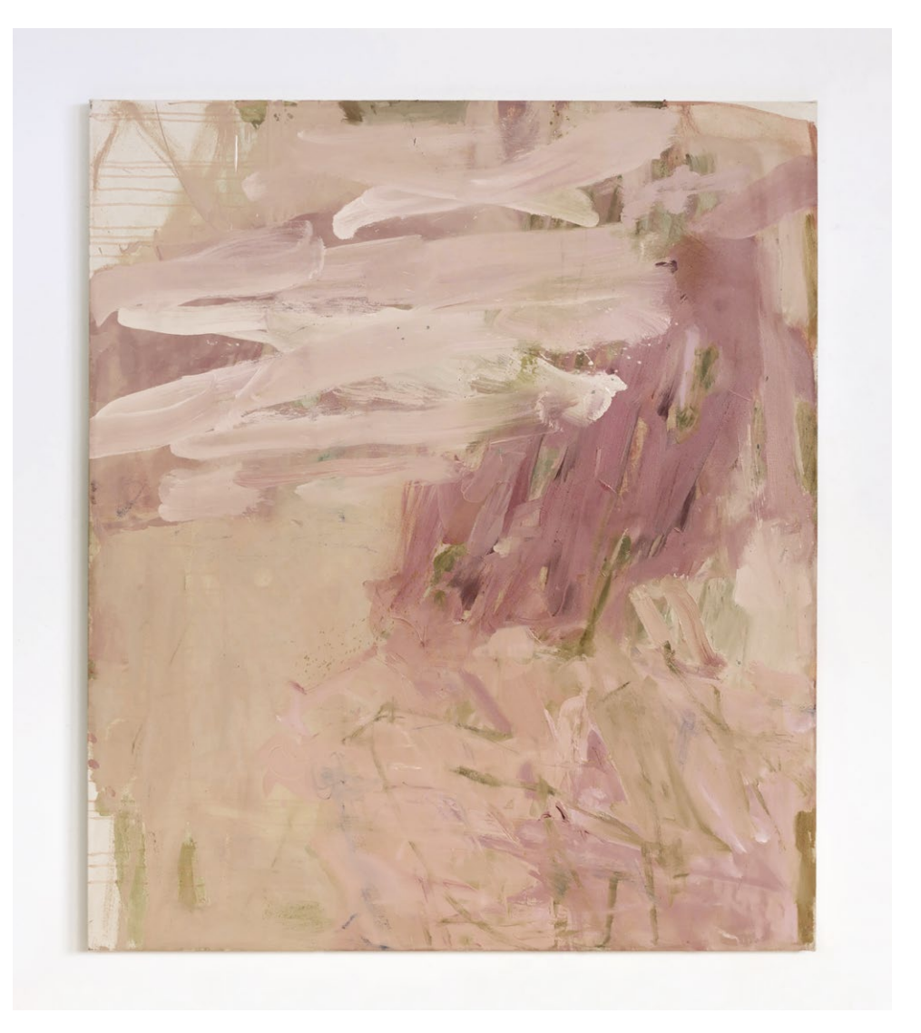
Magenta Remains 2023 oil on canvas 1200 × 1400mm