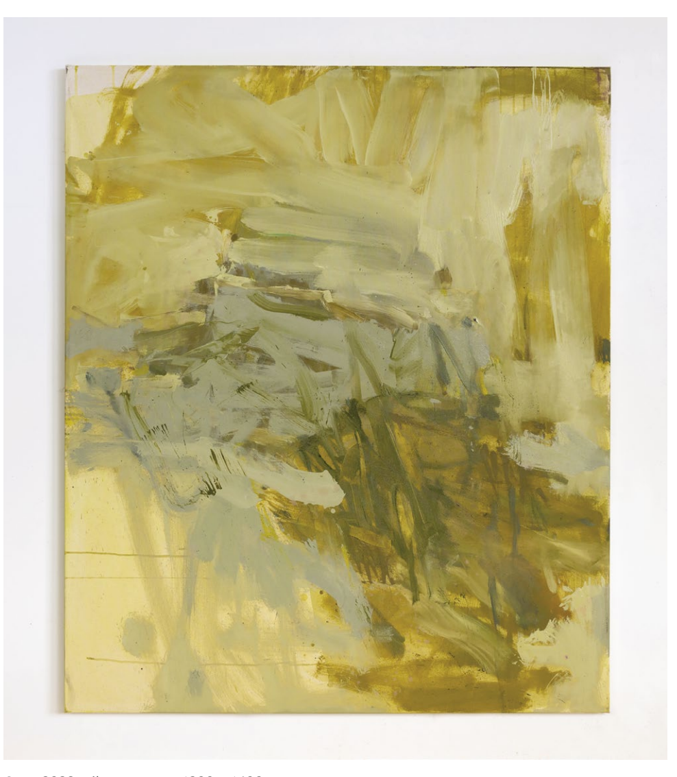
Azo 2023 oil on canvas 1200 × 1400mm

Cover: We played here once 2023 oil on canvas 1200 × 1400mm