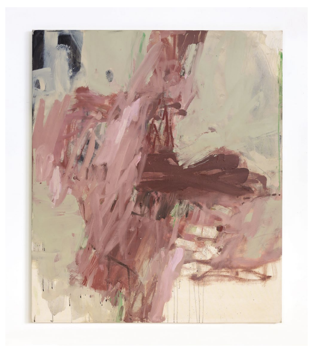
Arpeggio 2023 oil on canvas 1200 × 1400mm