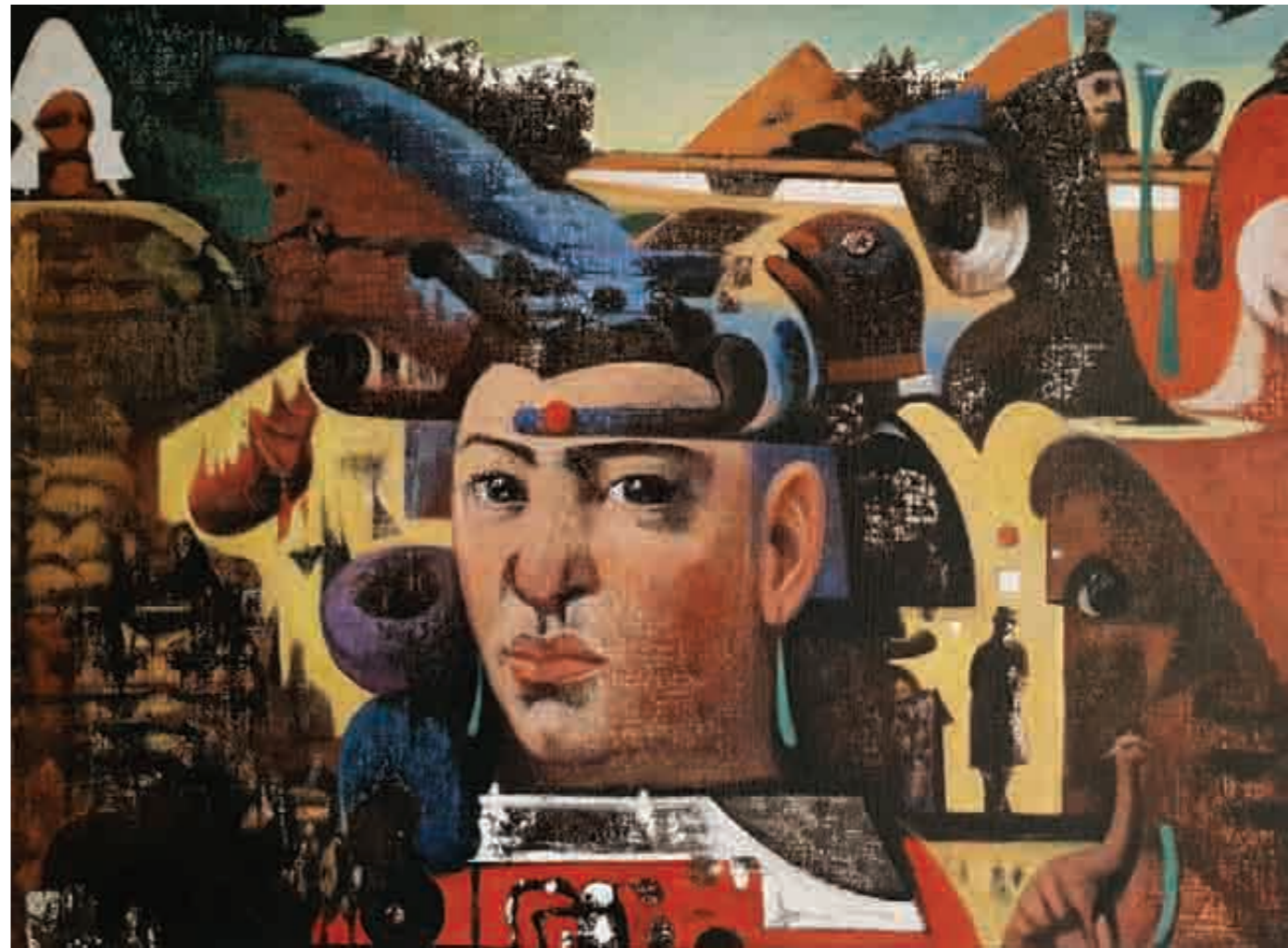
A Picture for Oum Kalthoum (2018-19) oil on canvas board 895 x 1220mm