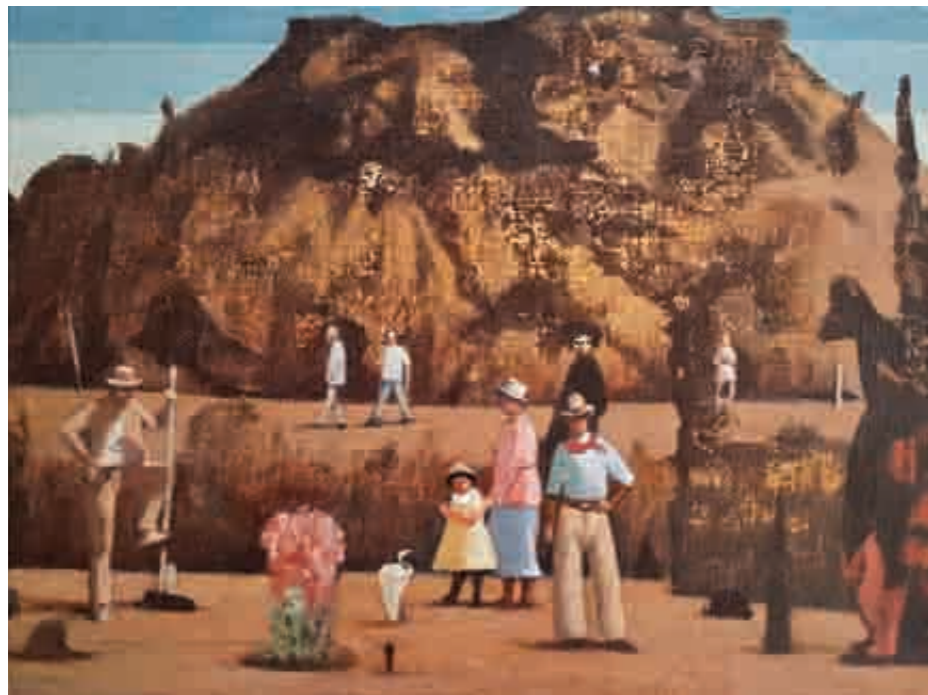
Cowboy Sabbath (2017-18) oil on canvas board 450 x 600mm Are We Nearly There Yet? aka, Call of the Wild (2017-18) oil on canvas 707 x 832mm