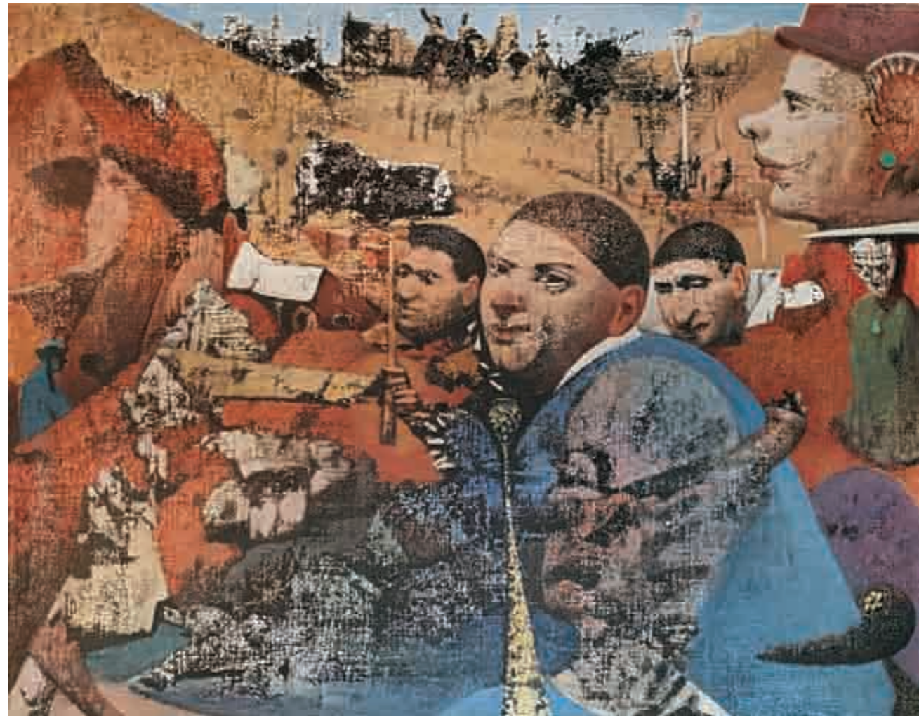
More Miles than Money (2018) oil on canvas board 1220 x 1540mm