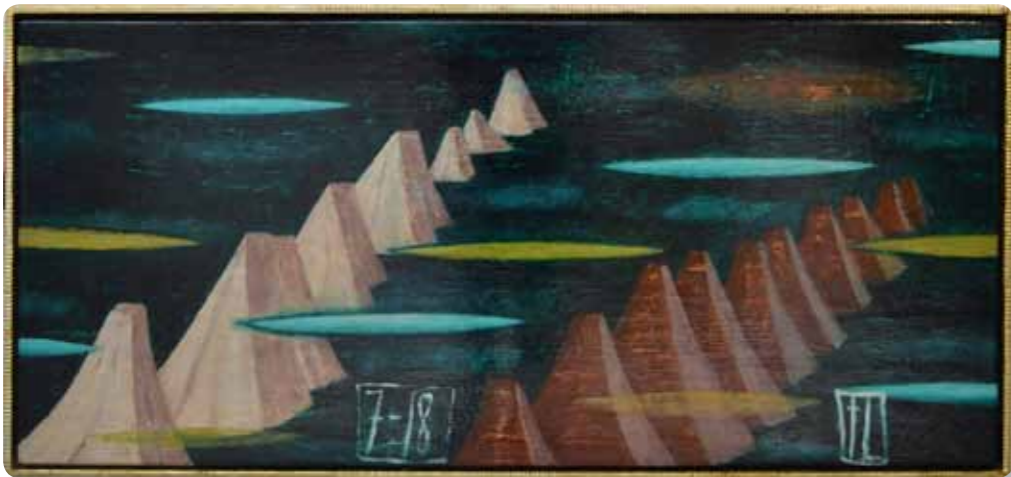
Back Range (2018) oil on gesso panel 640 x 1340mm