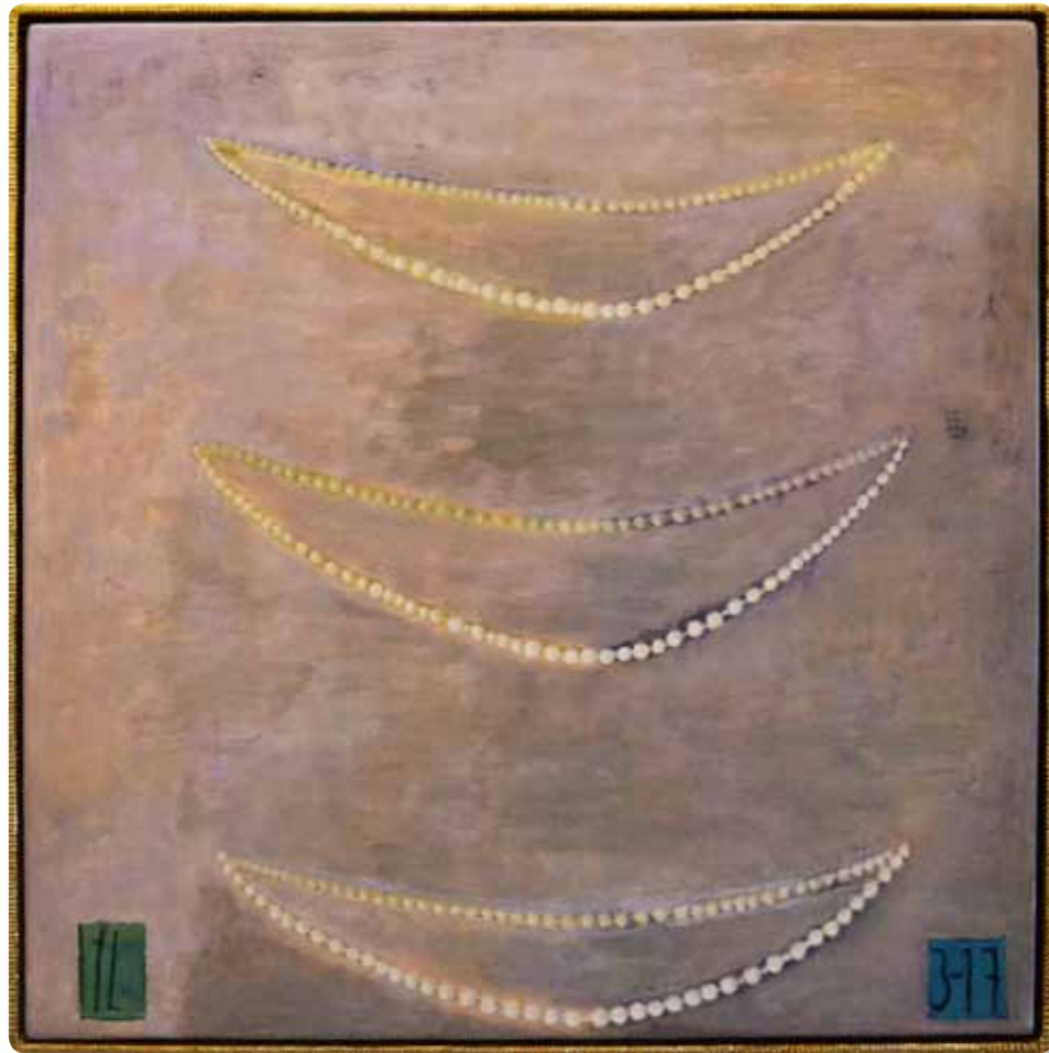
Necklace (2017) oil on gesso panel 1200 x 1200mm