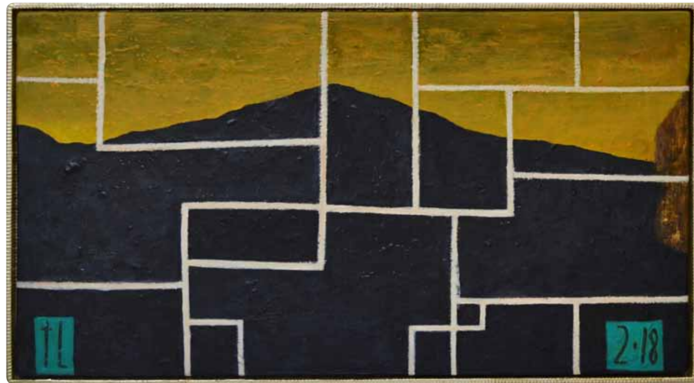
Last Light, Pakawau (2018) oil on gesso panel 690 x 1260mm

The artist is interested in our time, our place on earth, and within the cosmos. The paintings can be local, trees, hills, mountains, but they speak of journeys, isolation, meditation, and devotion. If they are to be considered votives, they are also objects of veneration, objects offered in fulfilment of a vow.