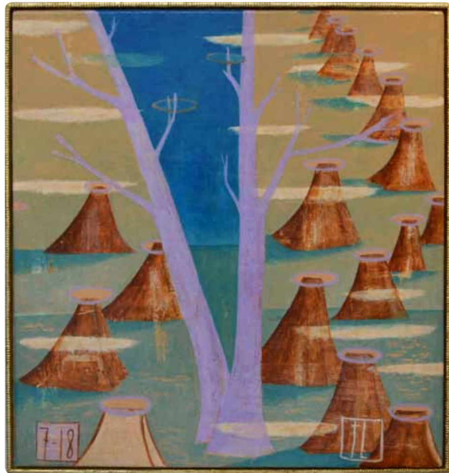
Double Vision (2018) oil on gesso panel 1140 x 1080mm