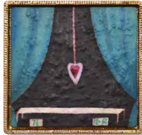
Pendant (2018) oil on gesso panel 350 x 375mm