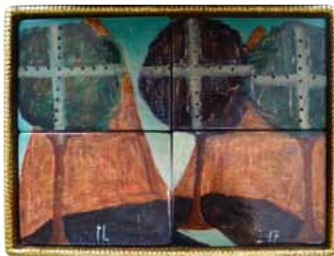
I Have Buried My Treasure Under These Trees (2017) oil on gesso panel 320 x 430mm