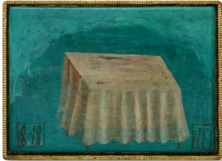
Table With Cloth (2018) oil on gesso panel 420 x 570mm