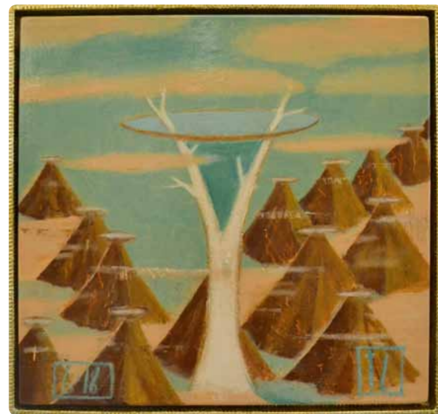
White Tree (2018) oil on gesso panel 640 x 680mm