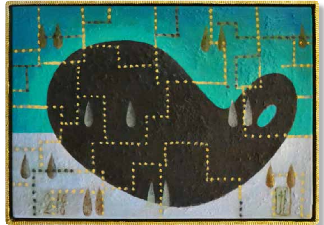
Palette (2018) oil on panel 620 x 870mm