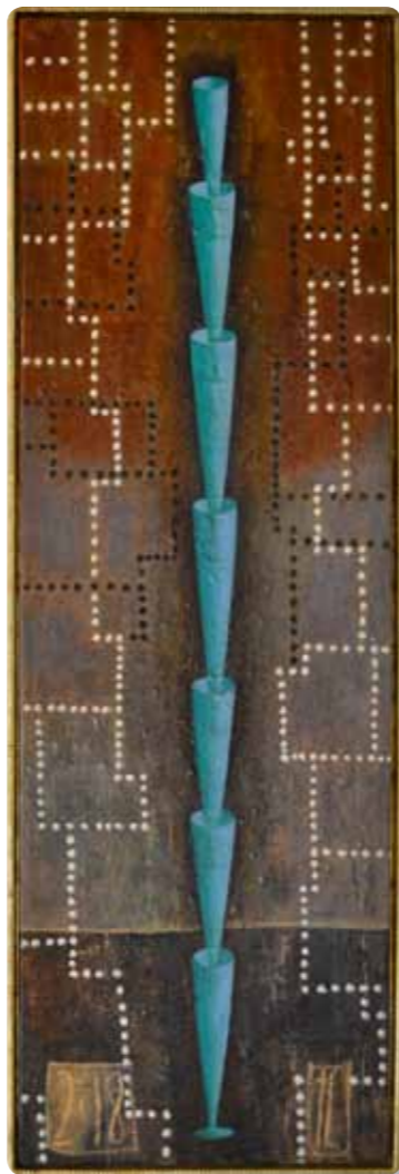
Stack (2018) oil on gesso panel 1800 x 595mm