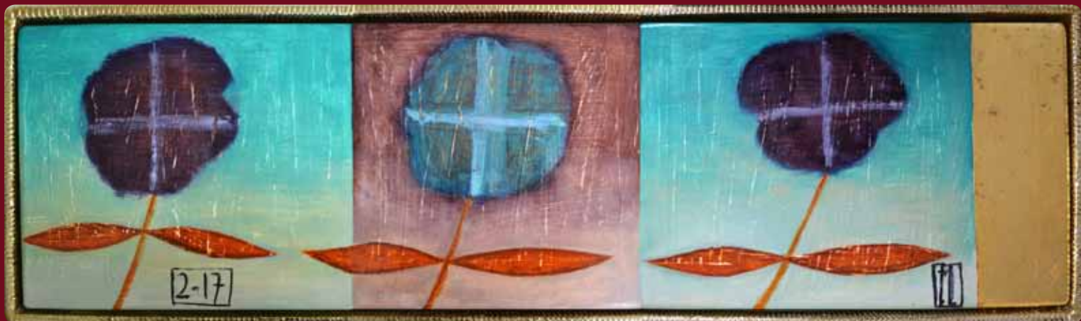
Day Through Night (2017) oil on gesso panel 370 x 1230mm