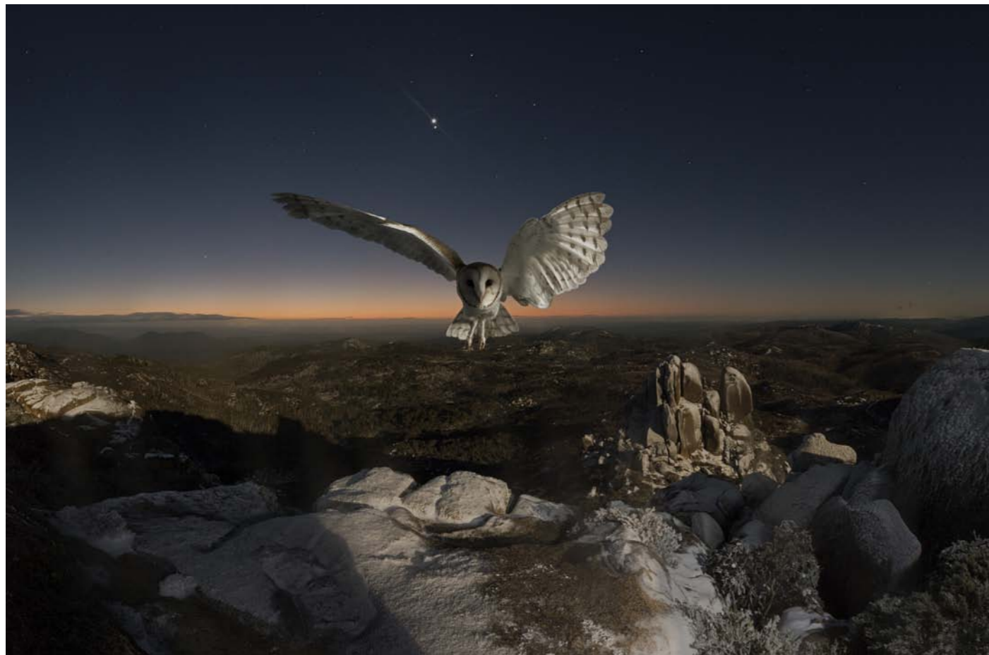
Detachment C-print 624 x 1000mm (edition 1/5)