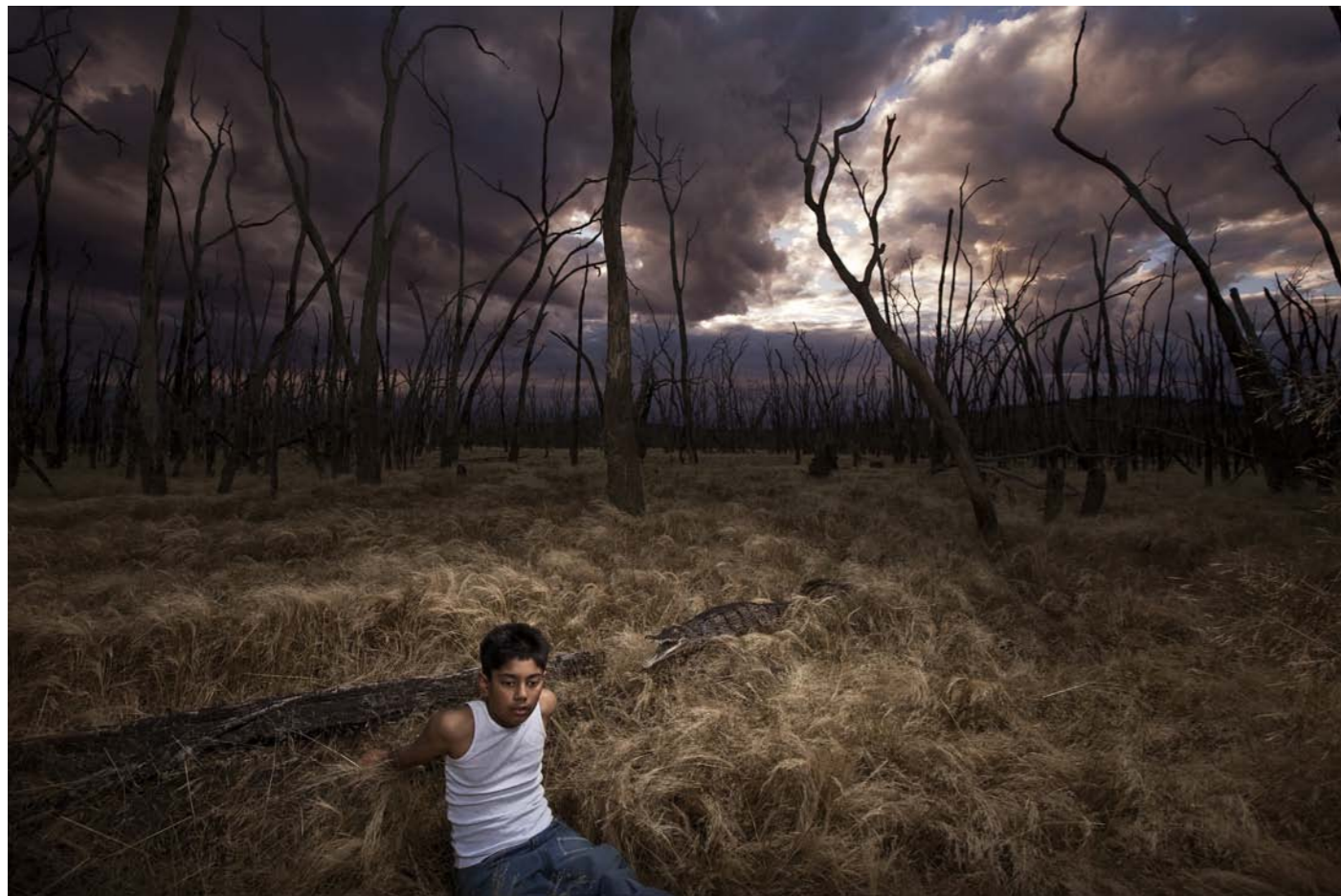
Nicholas C-print 666 x 1000mm (edition 1/5)