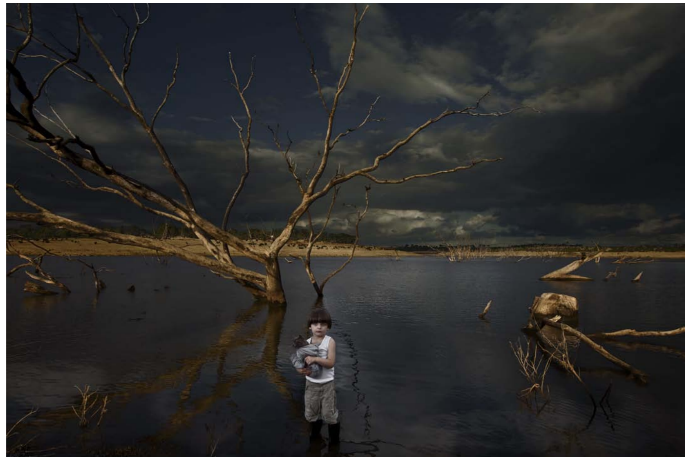
Otto C-print 662 x 1000mm (edition 3/5)