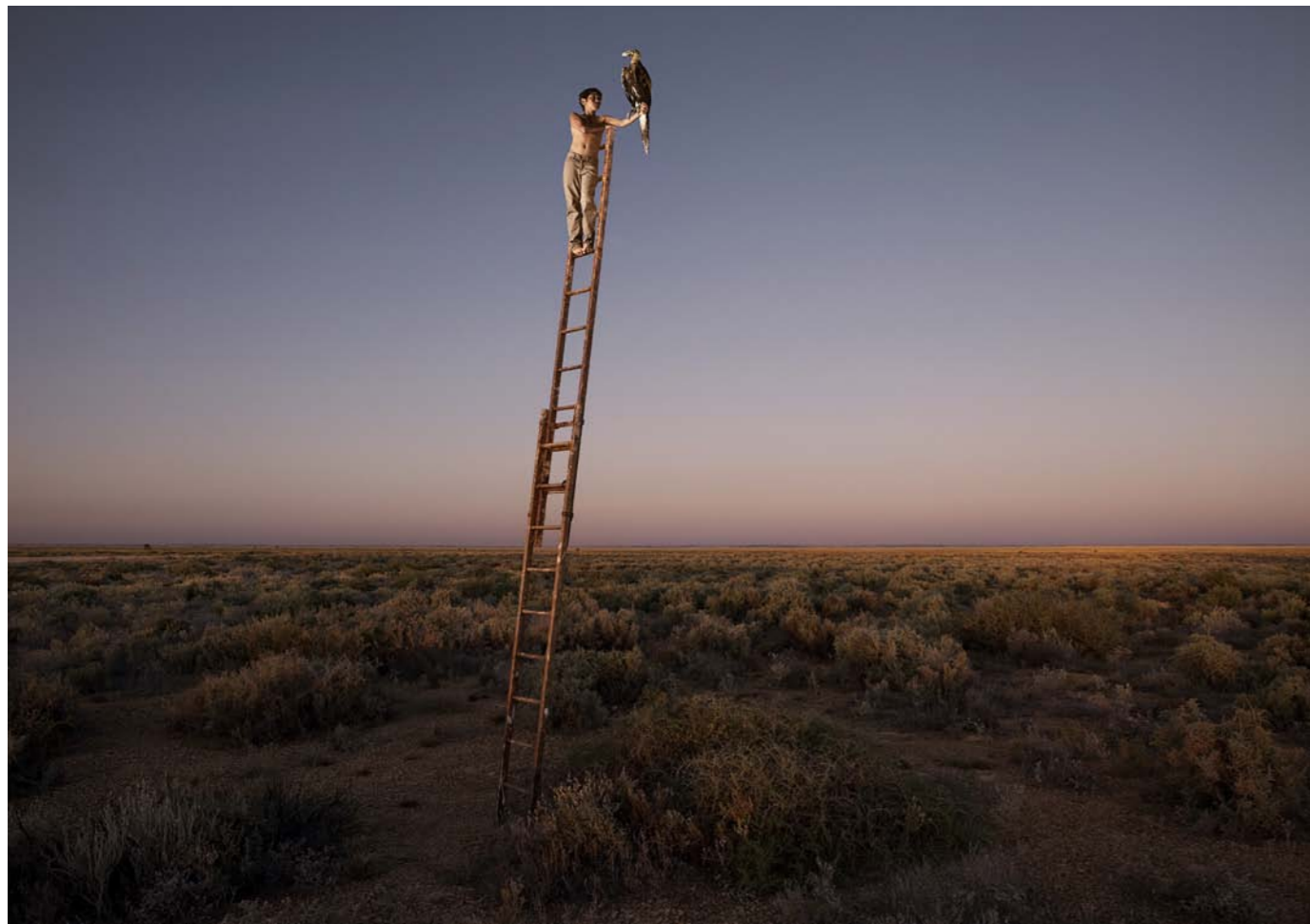
Tyson C-print 673 x 960mm (edition 2/5)