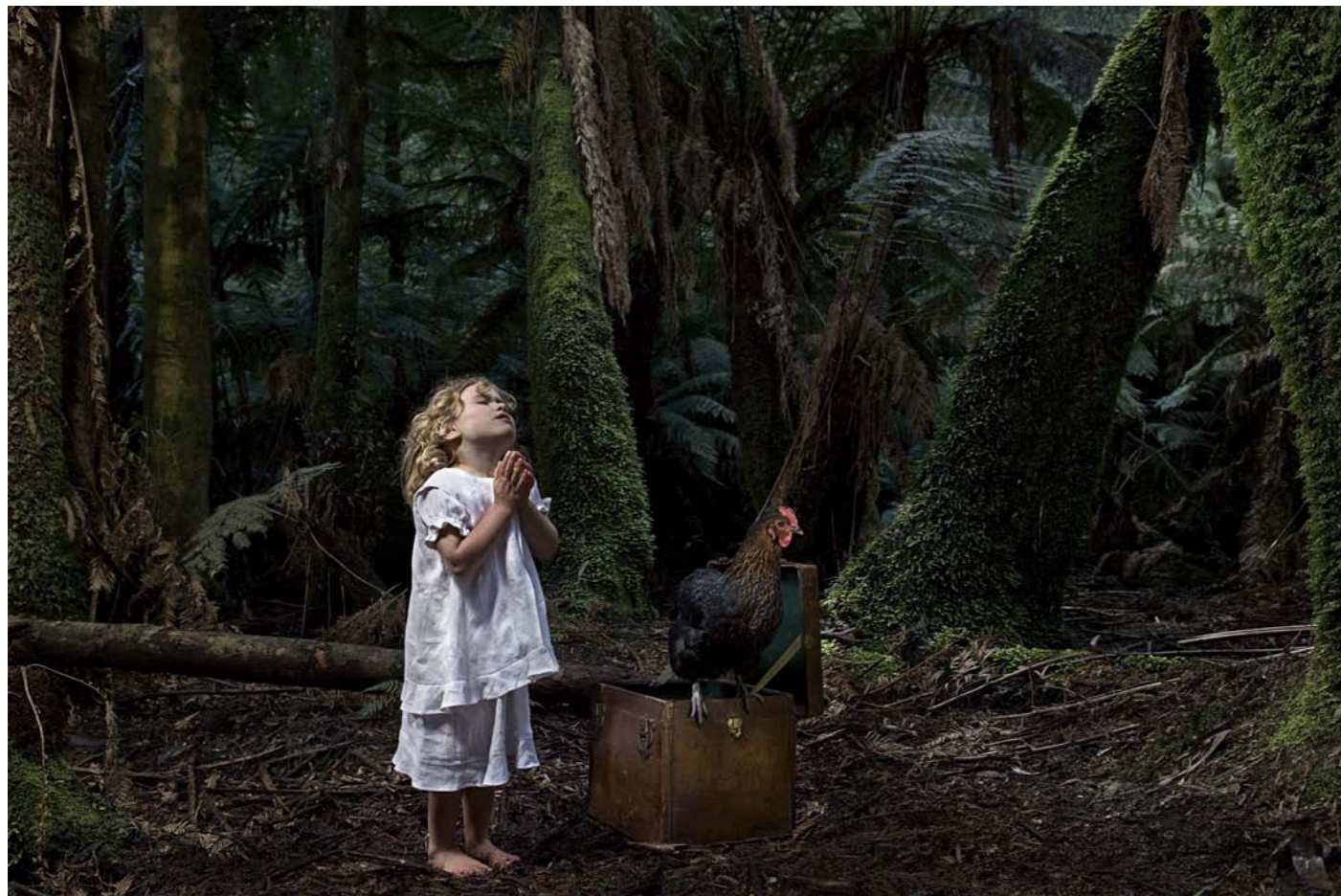
Anjani C-print 624 x1000mm (edition 5/5)