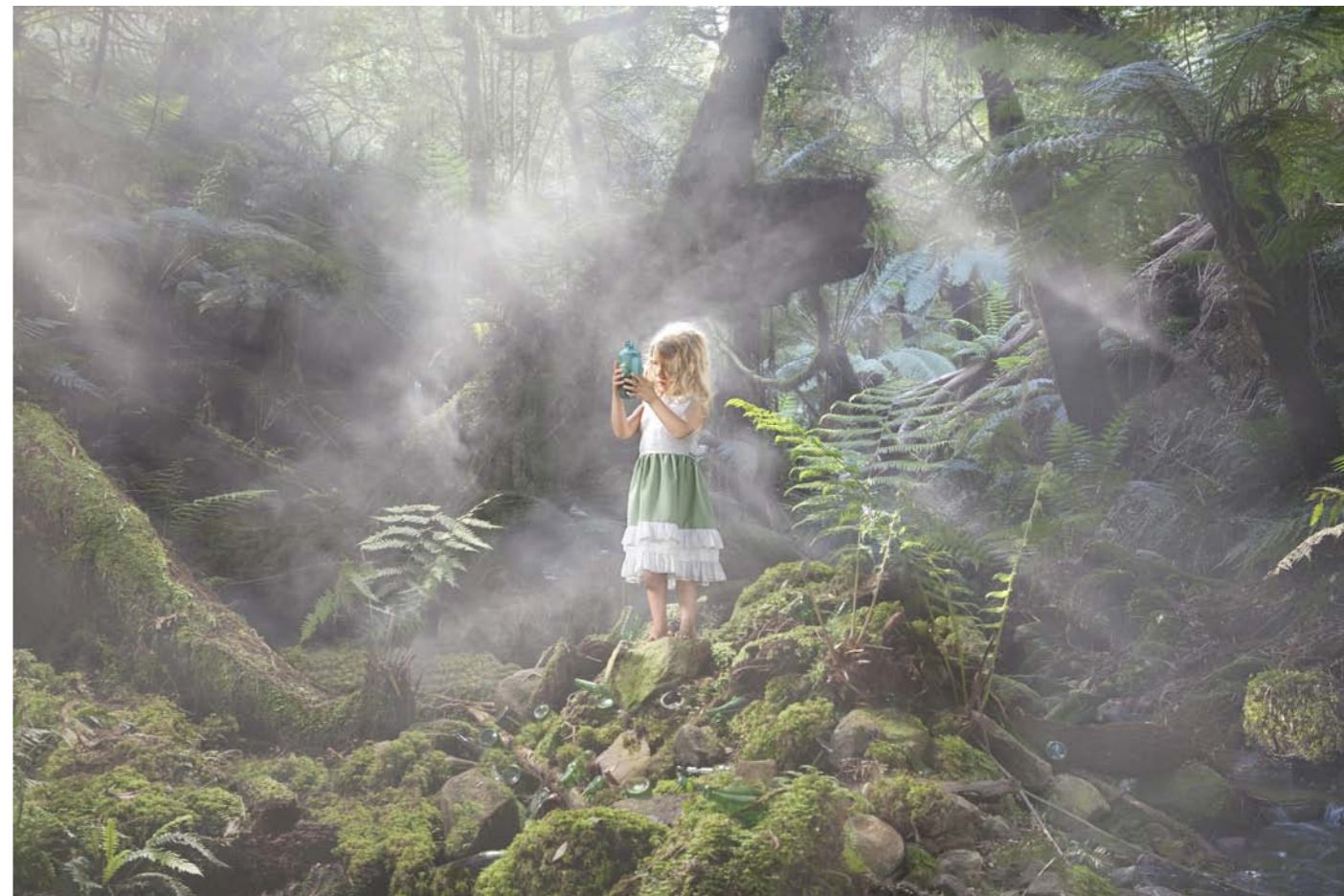
Anjani - forest C-print 624 x 1000mm (edition 2/5)