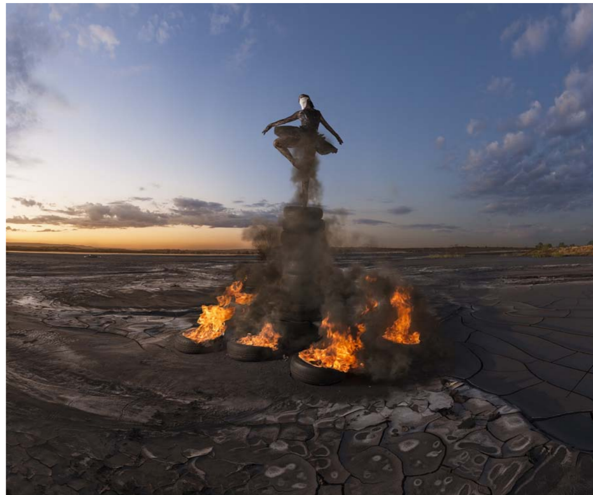
Trying to find a balance C-print 835 x 1000mm (edition 1/5) over: Sassy C-print 666 x 1000mm (edition 4/5) [detail]