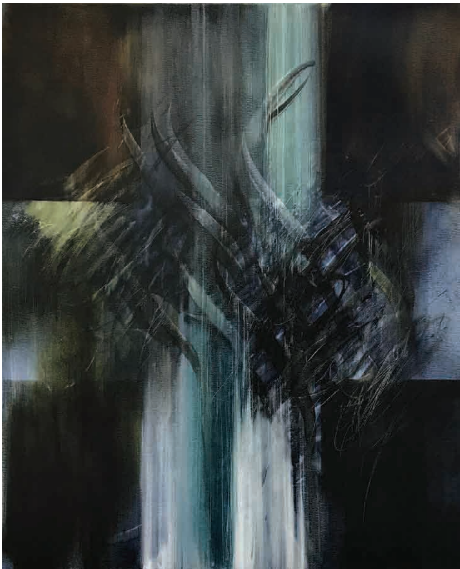
KATHY BARBER Out of Nothing