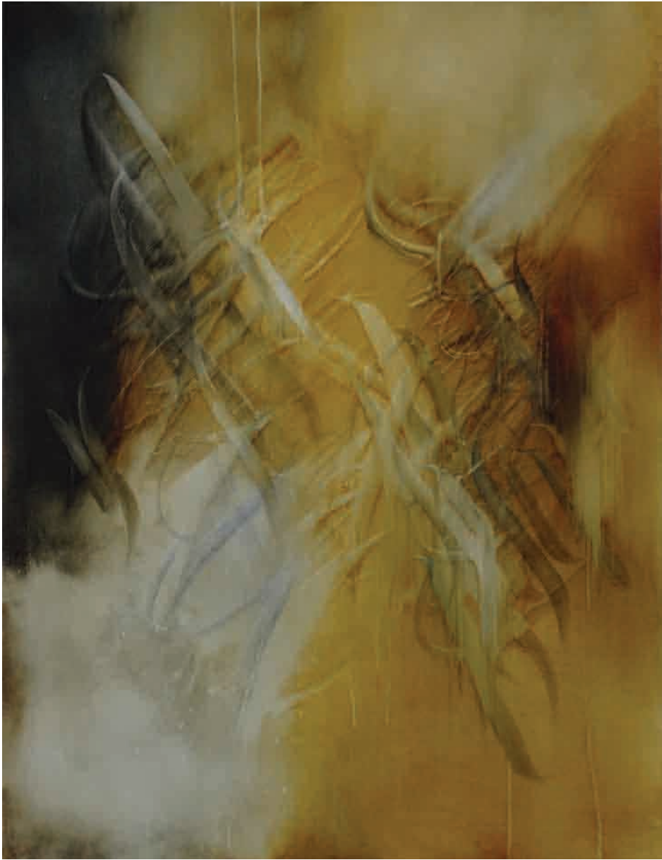
Cloudspeak (2018) acrylic and oil glaze on linen 1050 x 800mm