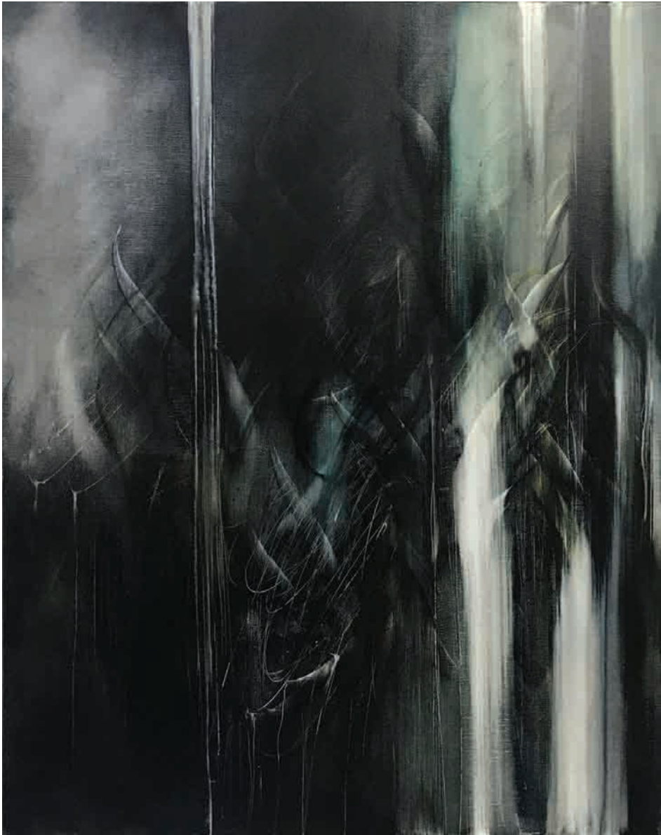
Raven (2018) acrylic and oil glaze on linen 1200 x 950mm