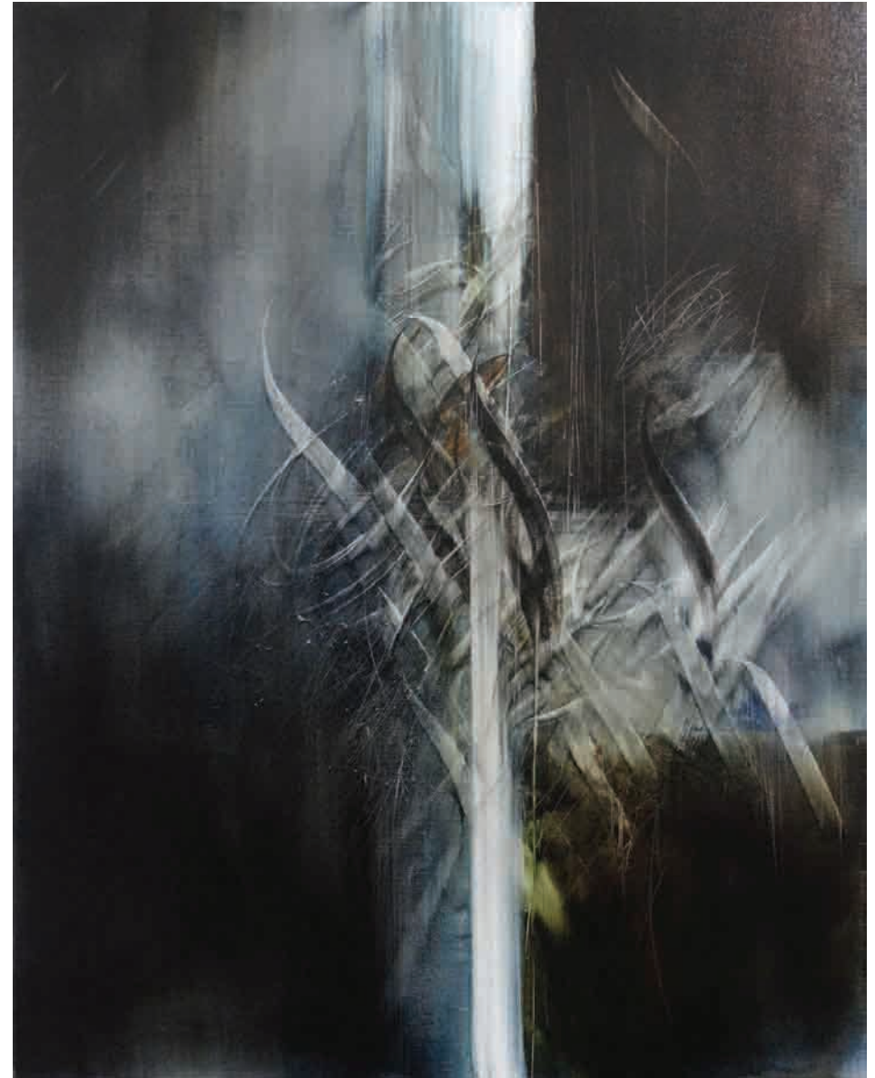
Cover: Out of Nothing (2018) acrylic and oil glaze on linen 1200 x 950mm Talisman (2018) acrylic and oil glaze on linen 1200 x 950mm

Out of nothing comes something inseparable from life, something biographically relevant – about the artist and about art.