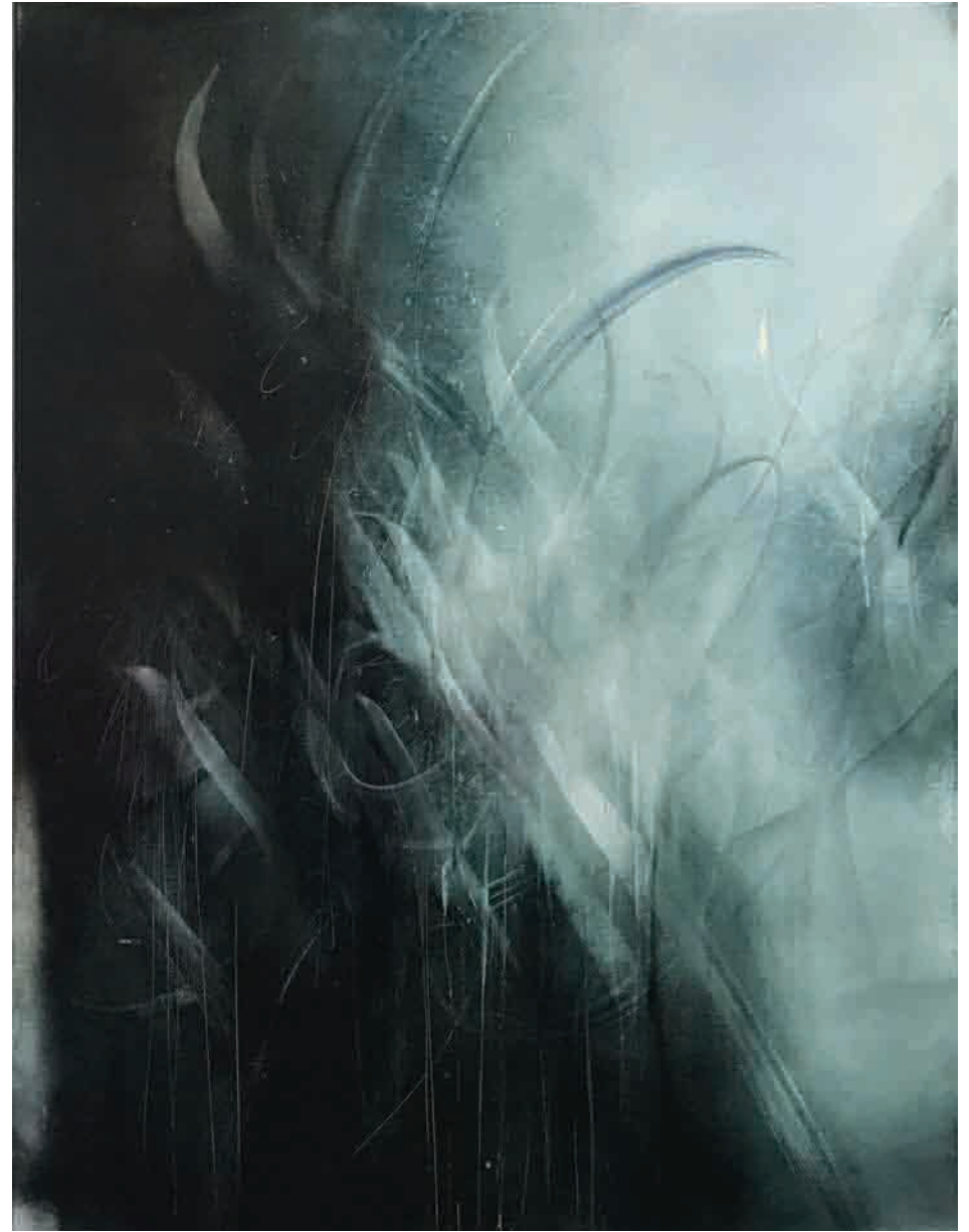
Lament for a Solitary Man (2018) acrylic and oil glaze on linen 1050 x 800mm Back cover: Void (2018) acrylic and oil glaze on linen 800 x 1050mm